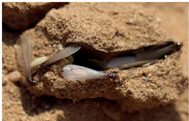
Figure 4.14: Alates (winged future Psammotermes queens and kings) in their waiting position within the tunnel system of a sand termite nest (Giribesvlakte Biodiversity Observatory, 19.03.2017).