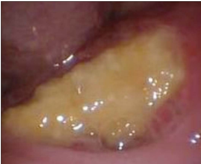
Figure 3. Mandibular focus of osteonecrosis in the mandible