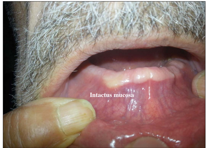
Figure 5. Healing of the mandibular mucosa after a period of follow-up

indicated to range between 1, and 21 percent. As suggested by many authors, in addition to clinically observed cases with osteonecrosis, occasionally radiological diagnosis is required. [13,14] In a study, a group of patients who received IV bisphosphonate infusions for approximately 35 times during a median period of 39.3 (11-86 mos) months without development of osteonecrosis, and a group that received IV bisphosphonate infusions for 15 times during a median period of 39.3 months (11-86 mos), and developed osteonecrosis were compared. The authors reported